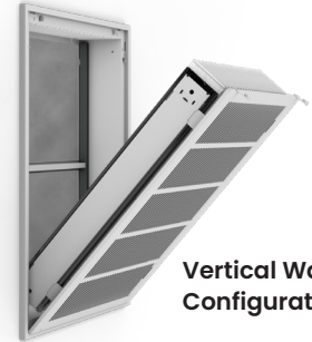
Vertical Wall Mount Configuration