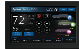
Intuitive User Interface 8840

The AprilAire Automation IAQ Control Thermostats consist of two components, the User Interface and the Equipment Control Module. The User Interface, located in the living space, integrates all indoor air quality functions – heating/cooling, humidification/dehumidification, air cleaning and ventilation in one attractive, easy-to-use, touch screen control. The User Interface offers homeowners the ability to easily set all of their IAQ and HVAC products from one location in the living space. The primary screen indicates how to easily activate and control set points. In addition, the display provides the homeowner with confirmation that the equipment is operating at the desired control settings.