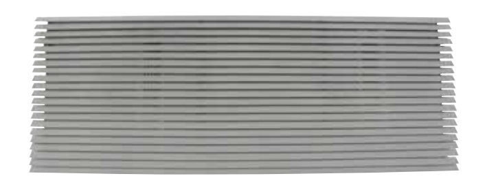
Dimensions W x H x D (inches)

Our architectural grille fits a standard 42" wall sleeve. It's formed from durable aluminium for weight reduction and weather resistance and powder coated for greater durability. Louvers are connected with high tensile rods. The grille comes factory assembled and includes four attachment points and two discharge air shaping deflectors