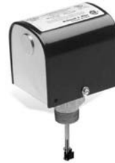
Remote Sensor Model RS-1-LP