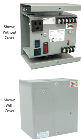
Shown Without Cover

* Move internal jumper to "HOT" position if you wish outlets to always be hot otherwise outlets will be switched by main breaker.