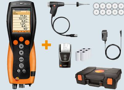
Kit with Printer and Paper shown above

includes testo 330-1 LX with O 2 and CO sensors; Li-Ion battery; AC power adapter; 12" flue gas probe, 1/4" dia., w 7 ft. hose; particle filters (10); certificate of conformity; and case